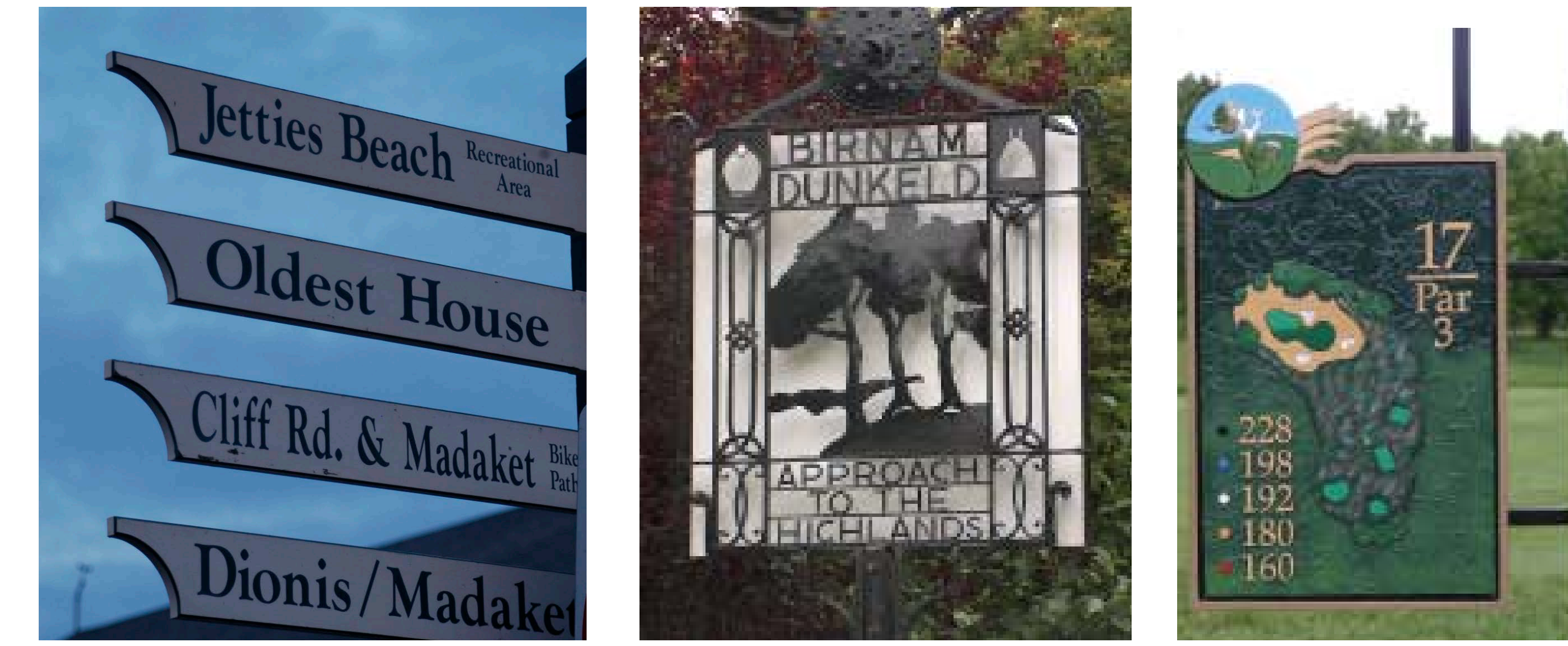
Project Informational Signs

An example of Discovery Land Company's comprehensive approach to site design is illustrated in the signage examples for the Yellowstone Club and other Discovery projects included here. These images are intended to illustrate an approach to signage and are not intended to specify design.