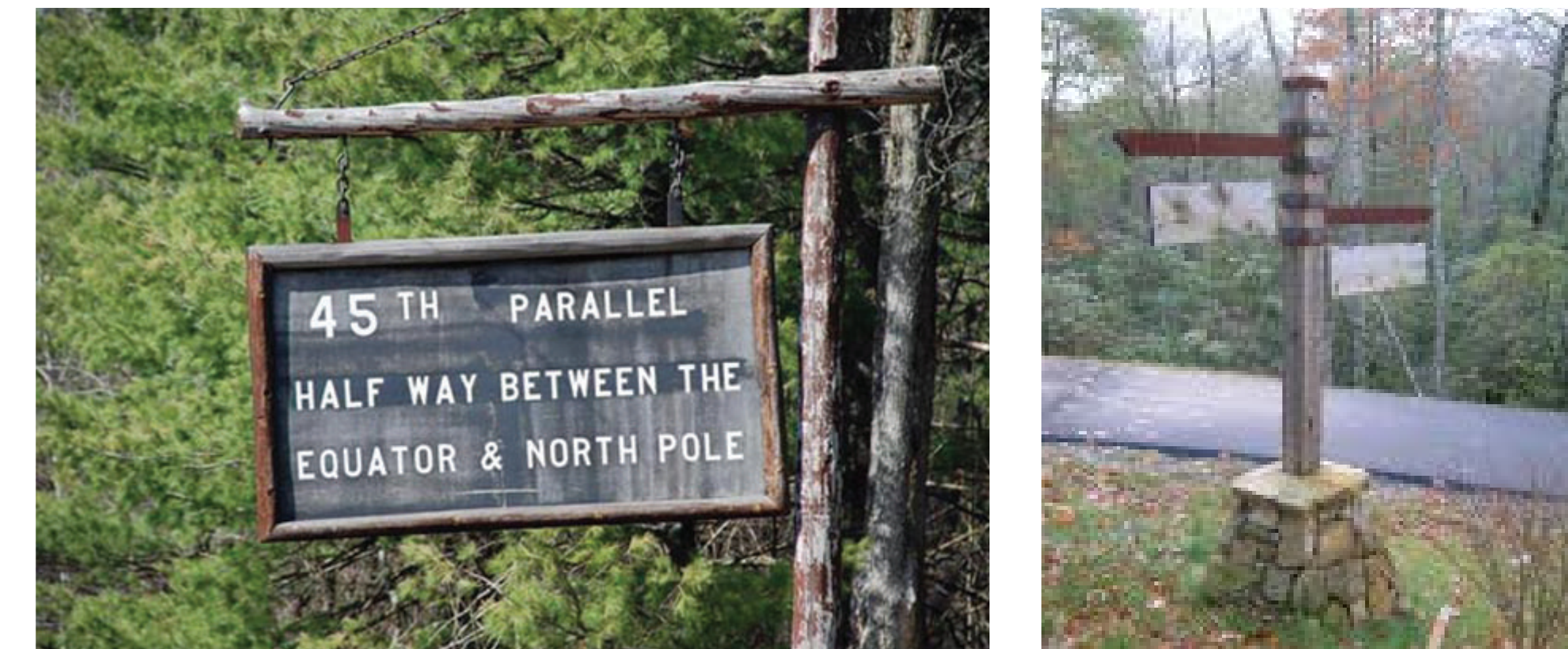
Project Circulation Identification